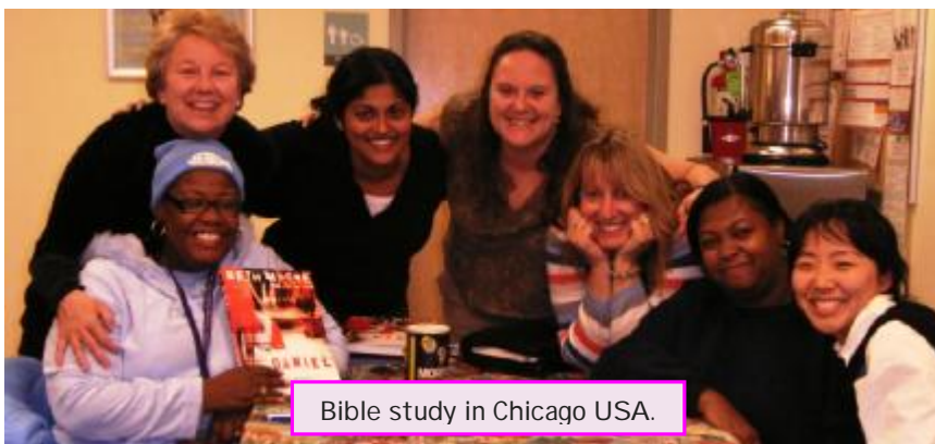
Bible study in Chicago USA.